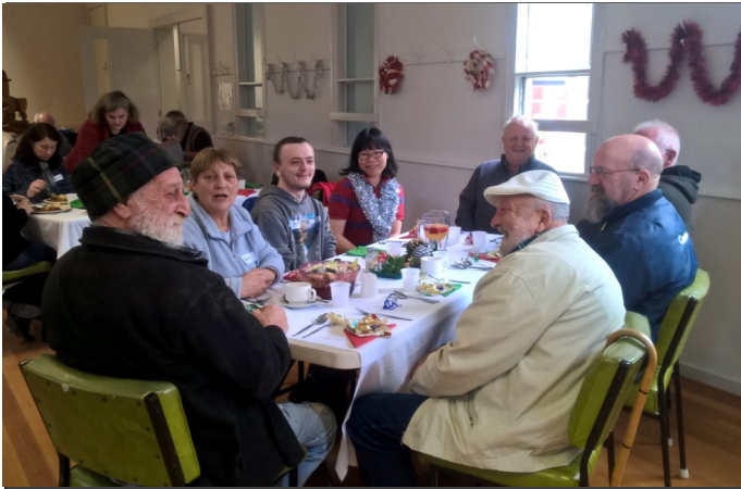
Members of the Dereel Men's Shed enjoy lunch.